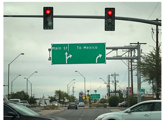
Travelling near the Mexican border.

But why? Why wander? I don't feel restless. Quite the contrary, I feel totally comfortable in my skin. What I DO feel is a relentless urge to move across the land, alone.