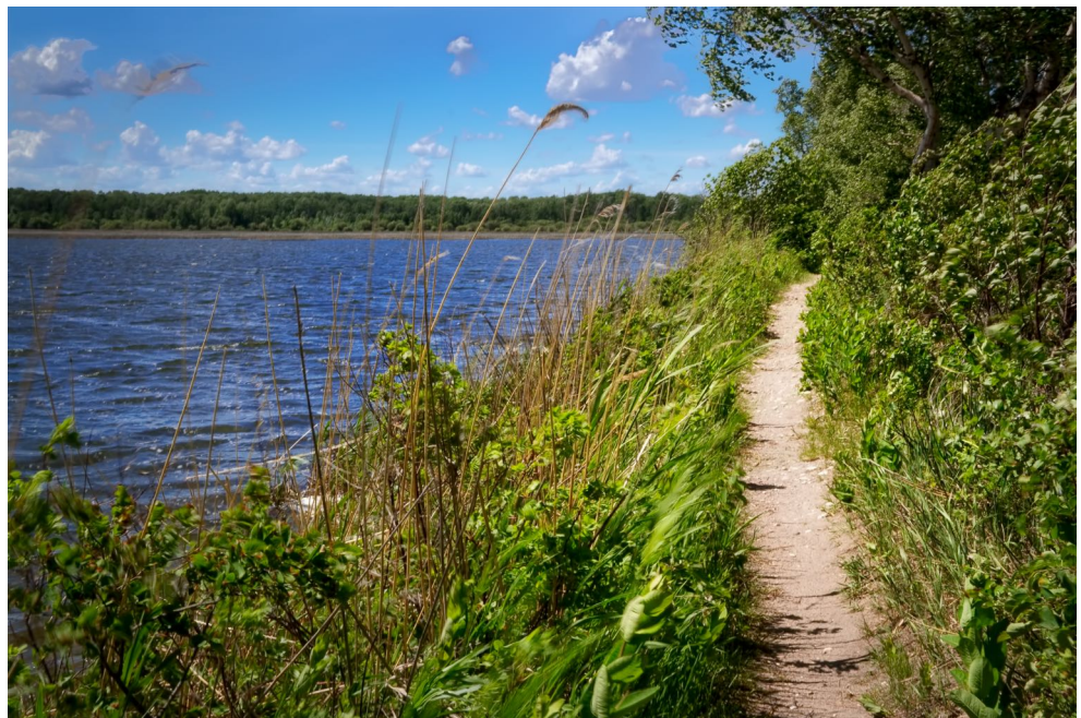
Clear Lake, Riding Mountain National Park, MB

Taking to the trails is one of the joys of summer when visiting Canada's national parks.