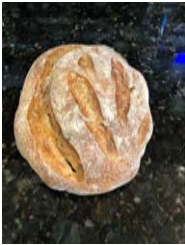
Almost There! Bread

Lately, I have been putting in more time working on our home. Since we first purchased it in 1989 (built in 1897?), every time you open a wall you receive one of two surprises. One, this has been in the wall how long what a treasurer or more often, I wished I would have left it alone! Lately, with a few extra hours on my hands(?), I have turned to learning the secrets behind baking Sourdough breads. Past experience working at Blak's Bakery during my early years should have made this an easy task. Not so, as I came to learn with many errors. The Sourdough bread is not quite perfected and still has a way to go. I have some great resourceful individuals guiding me along and who knows maybe there is another book in the future (🤔). I have been experimenting with the discarded sourdough starter on almost anything that comes to mind. The photos below are all Sourdough eats.