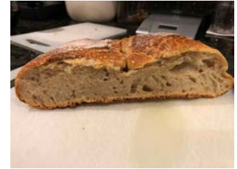
My 1 st -Flat Version Flop, but tasty 🤣