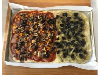
Italian & Sicilian Sourdough Pizza