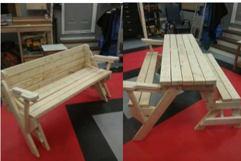
2 in 1 Picnic/Bench-Table

When this is all over, he is looking forward in planning a long vacation when the time comes, but until then Linda is keeping him very active. I, like others, may have a few projects in the wings for him. From my understanding he has been propositioned to build as far out east as Newfoundland!