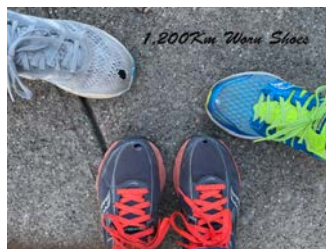
Last year's holey shoes

Petting dogs, identifying birds and meeting new people along the way. I am pretty sure they have all purchased new runners. Walking must have something in it as the shades bring on younger and cooler looks! If they break the 3000kms mark this year, I believe a new pair of runners may be in the wind?