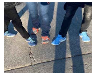
2021 updated style

I am banking on the ladies hitting the 3000kms mark!