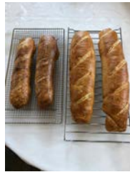
Olive Bread Baguette Test