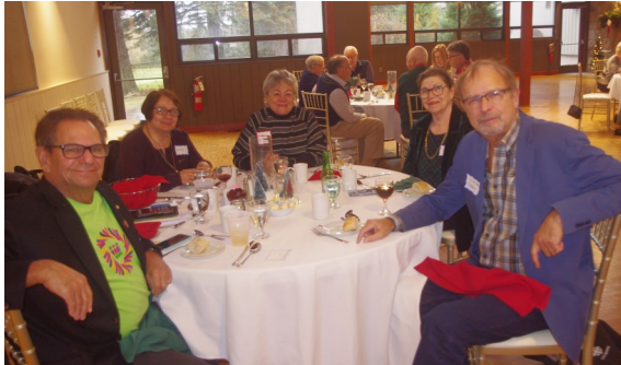
Fantastic turkey lunch for the Durham-Trent AGM and holiday event