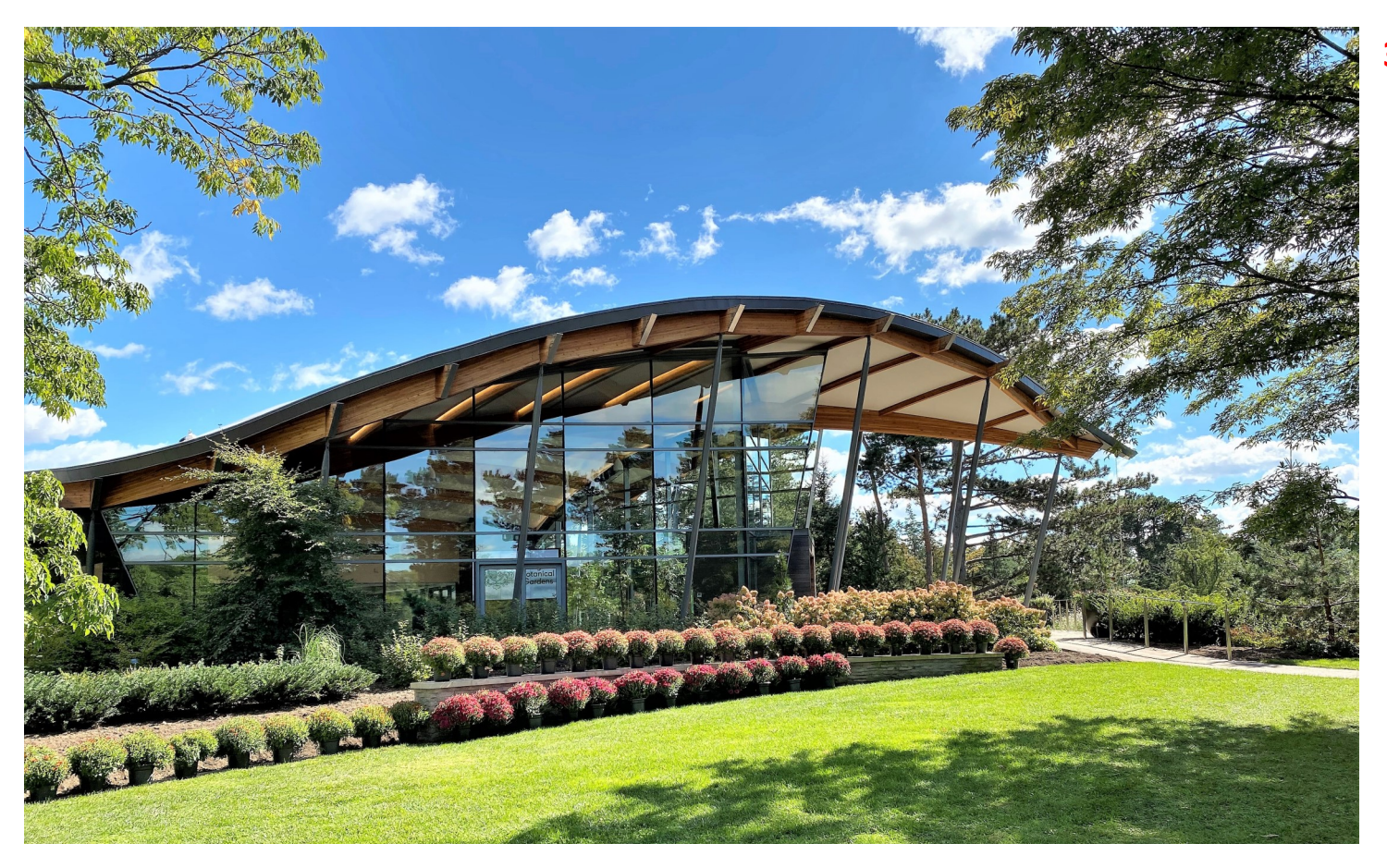
The RBG's Rock Garden - 1185 York Blvd, Hamilton, ON LOR 2H9