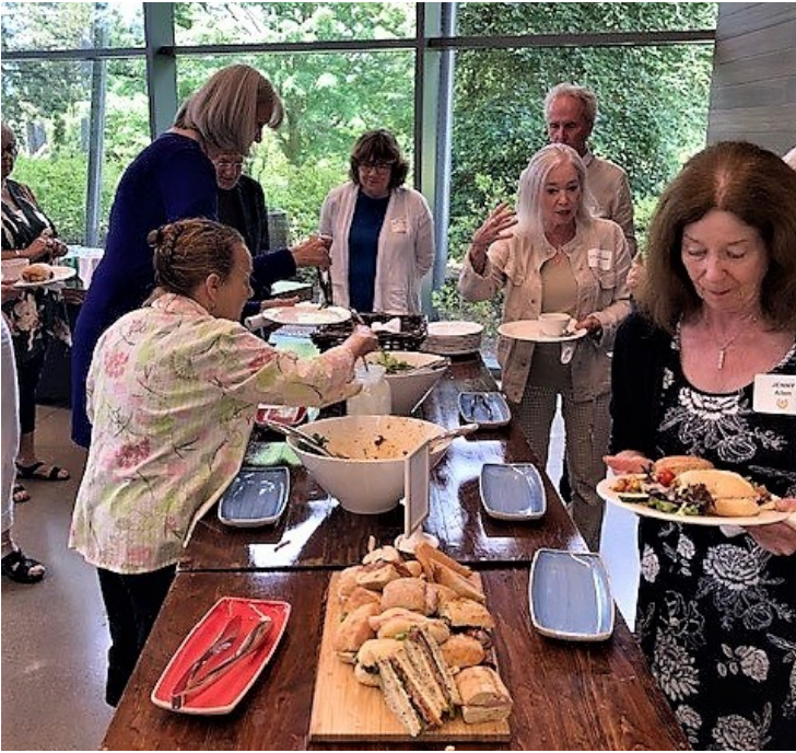
First to lunch: the Plains Road Deli Buffet