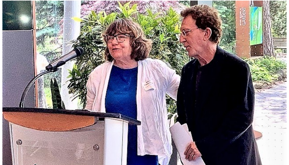
Pages 4-7